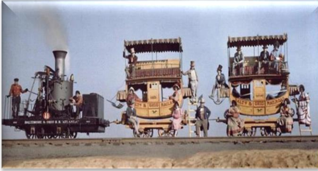
History of Railways in USA